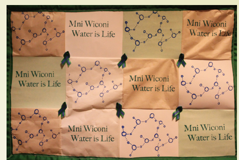
Mother Water - Angela Two Stars