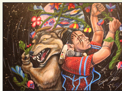
Water Warriors - Alan Compo