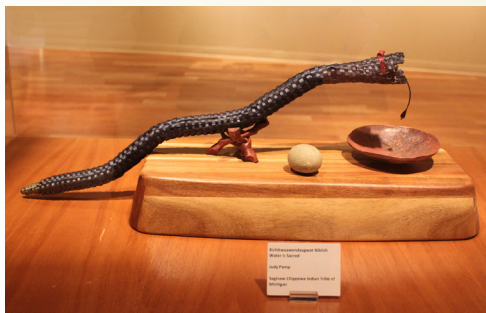
Kitchitwaawendaagwat Nibiish Water is Sacred - Judy Pamp